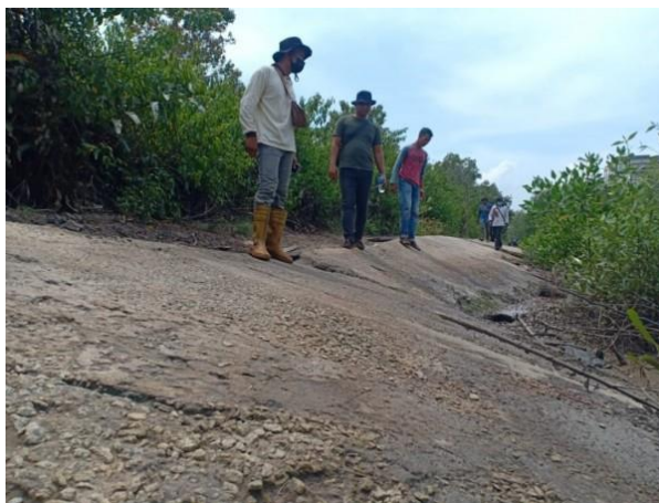
Figure 1. Livelihoods of farming communities and entrepreneurs.

The existence of public trust or trust in these financial institutions makes them the main choice in terms of borrowing funds. This social phenomenon or condition of society makes a paradigm that has actually existed in society for a long time. However, for some reason, it becomes a habit that has taken root in society. The absence of other choices or options for financial institutions makes people choose existing financial institutions, even though, in principle, the people there uphold religious values such as avoiding usury. However, this situation forces them to choose a financial institution that, by model, still implements an additional system in the event of a late payment. By model, the system used by UED-SP adheres to a conventional system. This did not prevent the community from borrowing funds from the UED-SP. Therefore, researchers see that there is something worth researching, whether the model of agreement in transactions carried out by UED-SP and its services is compatible with business ethics in Islam so that it has an appeal to the local community (Malays) who, in fact, are Muslim. So it is necessary to discuss in depth about the Savings and Loan Transaction Agreement from the Perspective of Islamic Business Ethics (Savings and Loans Village Economic Business Study (UED-SP) Barokah Mandiri Penampi Village, Bengkalis, Riau).