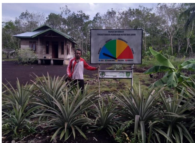
Figure 2. UED-SP Barokah Mandiri.

The village economic business saving transaction model (UED-SP) carried out by the Barokah Mandiri financial institution in Penampi Village in this study obtained several highlight points which were discussed. In several visits, observations and observations that have been made, some data is obtained in the form of an explanation of the services and contract models that are applied.